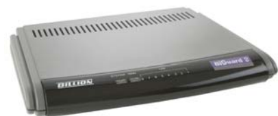
▲ BiGuard 2