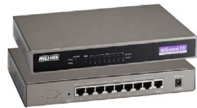
▲ BiGuard 10